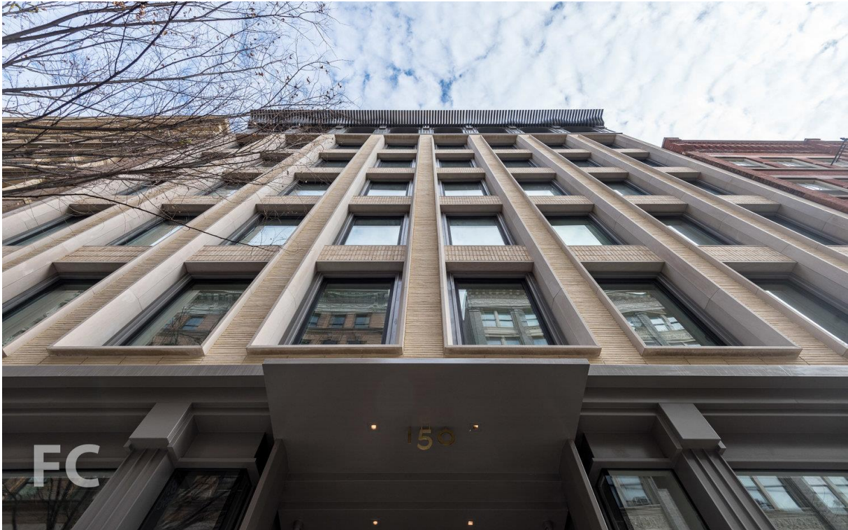
Looking up at the west facade.