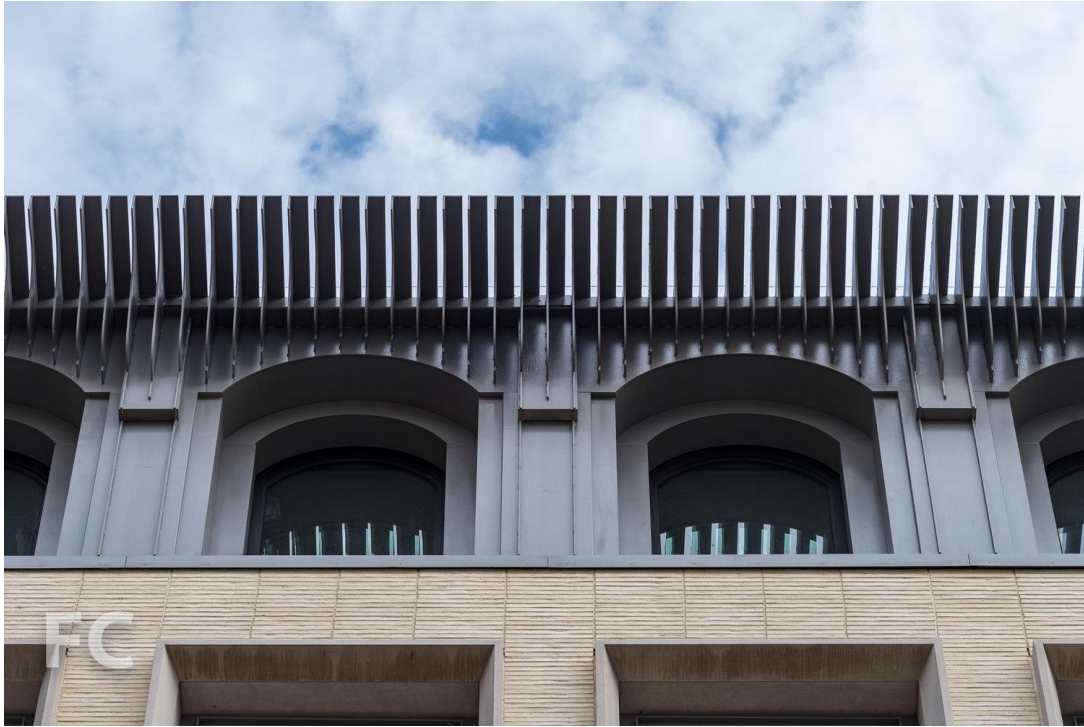
Close-up of the top floor.