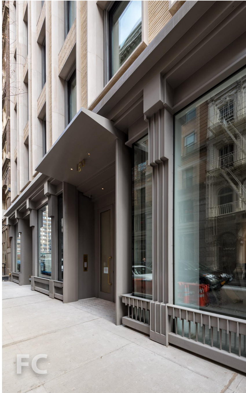
Residential entry and retail at the ground floor.

Design Architect/Developer: KUB Capital; Architect of Record: HTO Architect; Landscape Architect: Future Green; Program: Residential, Retail; Location: SoHo, New York, NY; Completion: 2017.