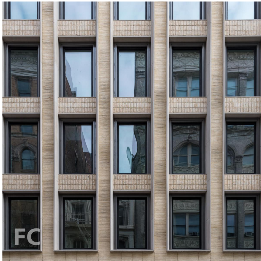
Close-up of the west facade.