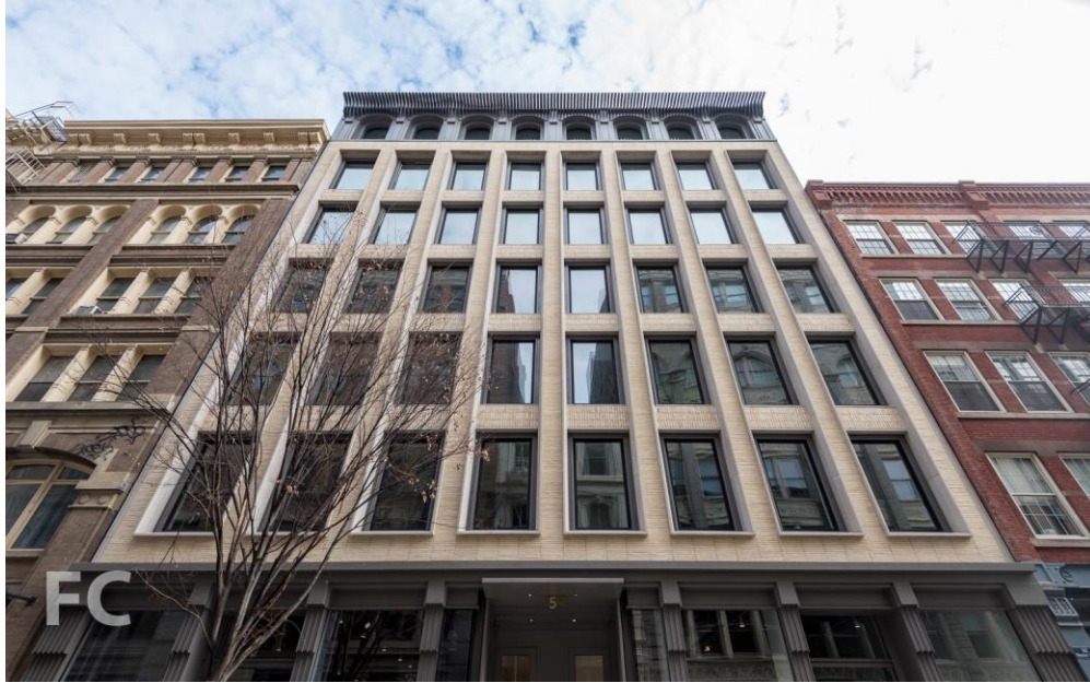
Looking up at the west facade.