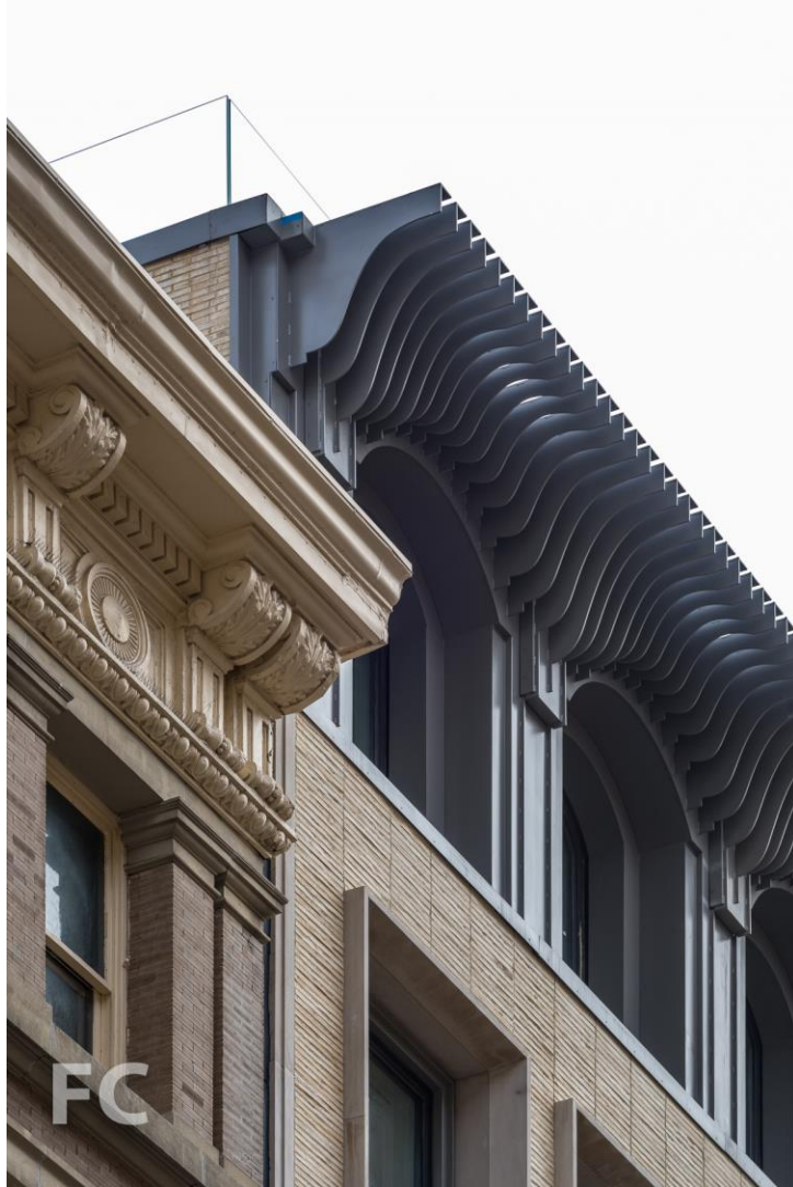
Close-up of the parapet at the northwest corner.

The Wooster Street facade features a pallet of materials inspired by the neighborhood. Indiana limestone framed punch windows are set in a field of handmade Petersen bricks from Denmark. The storefront and residential entry base, as well as the cornice, feature cast iron details.