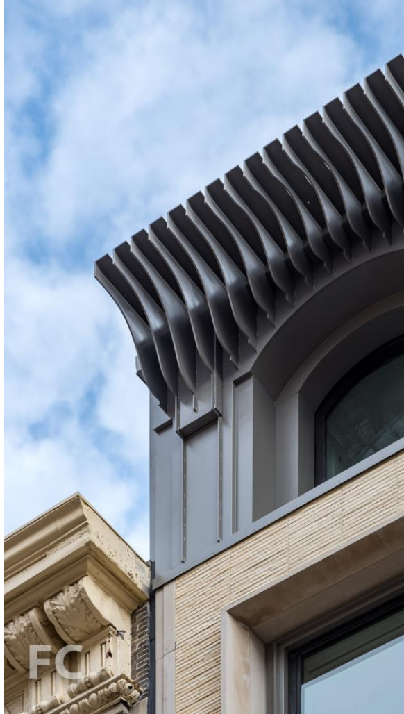
Close-up of the parapet at the northwest corner.