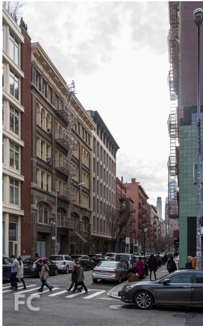
Looking south from Houston Street.

Construction has wrapped up at 150 Wooster, an 8-story residential building developed and designed by KUB Capital. The building replaces a 1-story retail structure and parking lot and required approval from the Landmarks Preservation Commission due to its location in the historic SoHo neighborhood.