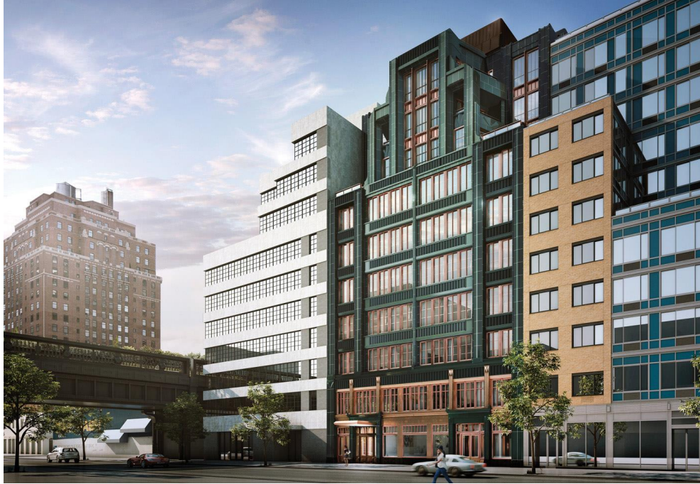
The Fitzroy. Official rendering, via JDS Development

The residences start at $5.6 million and are being marketed by CORE. Amenities include a 24-hour attended lobby, a fitness center designed by La Palestra, a wine cellar with designated cabinets for each resident, a landscaped rooftop with a kitchen, an art studio for children, bike storage, and a climate-controlled storage room.