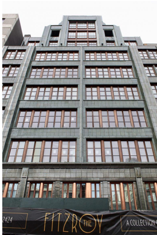
The northern elevation of The Fitzroy at 514 West 24th Street.

A handsome Art Deco-inspired exterior adorns the The Fitzroy, located at 514 West 24th Street, which is now practically complete. The insides are also nearing the finish line, and will soon open to prospective residents. The project is being designed by Roman and Williams, and developed by a partnership between JDS Development and Largo Investments.