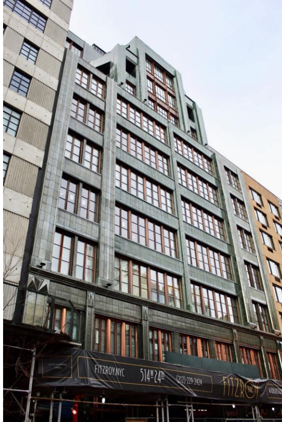
The northern elevation of The Fitzroy at 514 West 24th Street.

The scaffolding is nearly disassembled, except for the ground floor, where signage displays the name of the building in Art Deco font. The detailing in the facade is superb, and something to admire in different lighting and times of the day. Spotlights for the exterior face upwards, and have already been installed. They're being designed by L'Observatoire International.