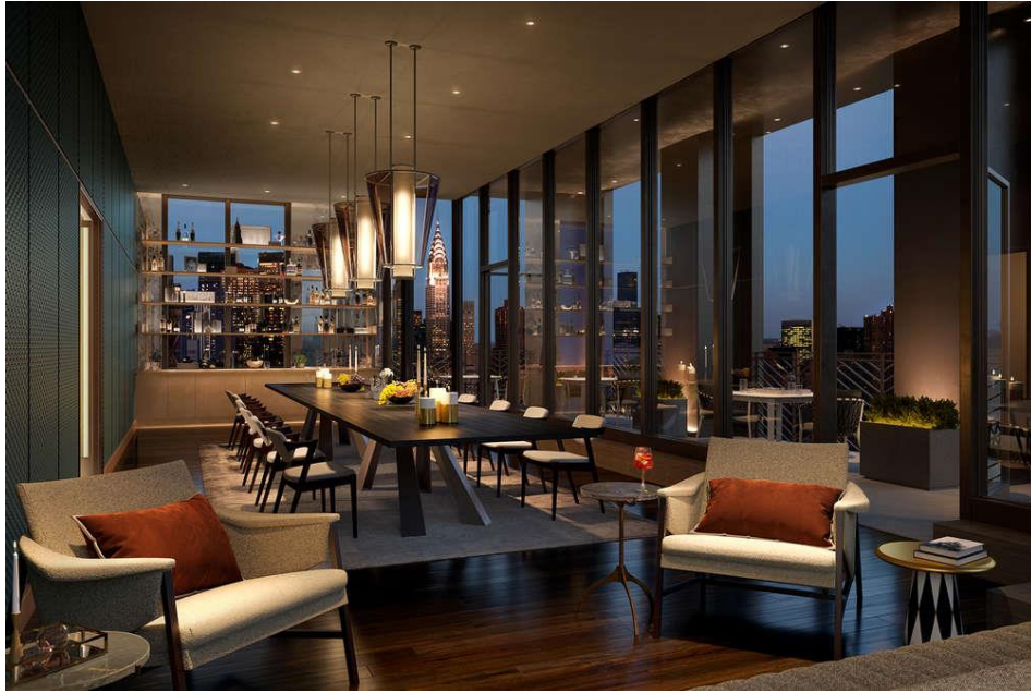
Private dining room

Rose Hill is rising in a particularly bustling section of NoMad near Madison Square Park, several fine dining establishments, popular nightlife, abundant shopping, and several transportation options. Closings are estimated for fall 2020.