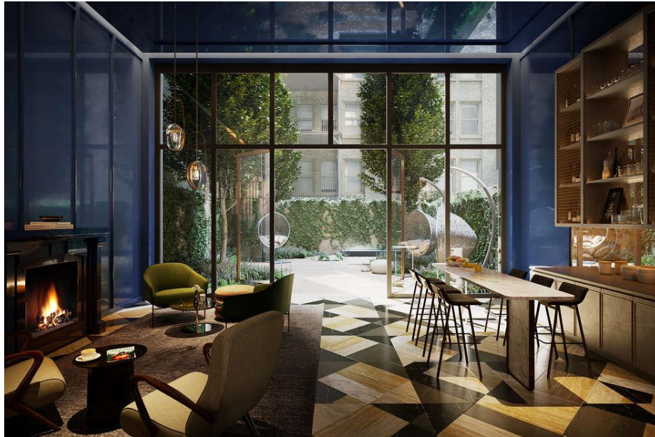
The Blue Room

office, nursery, home gym, dressing room, or whatever else the buyer can dream up. Penthouse residences feature marble fireplaces, large soaking tubs, and private terraces.