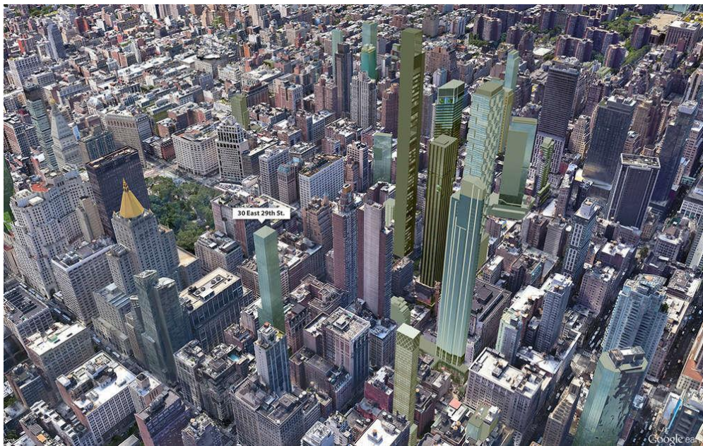
Google Earth map of Rose Hill

Rose Hill is rising in a particularly bustling section of NoMad near Madison Square Park, several fine dining establishments, popular nightlife, abundant shopping, and several transportation options. Closings are estimated for fall 2020.