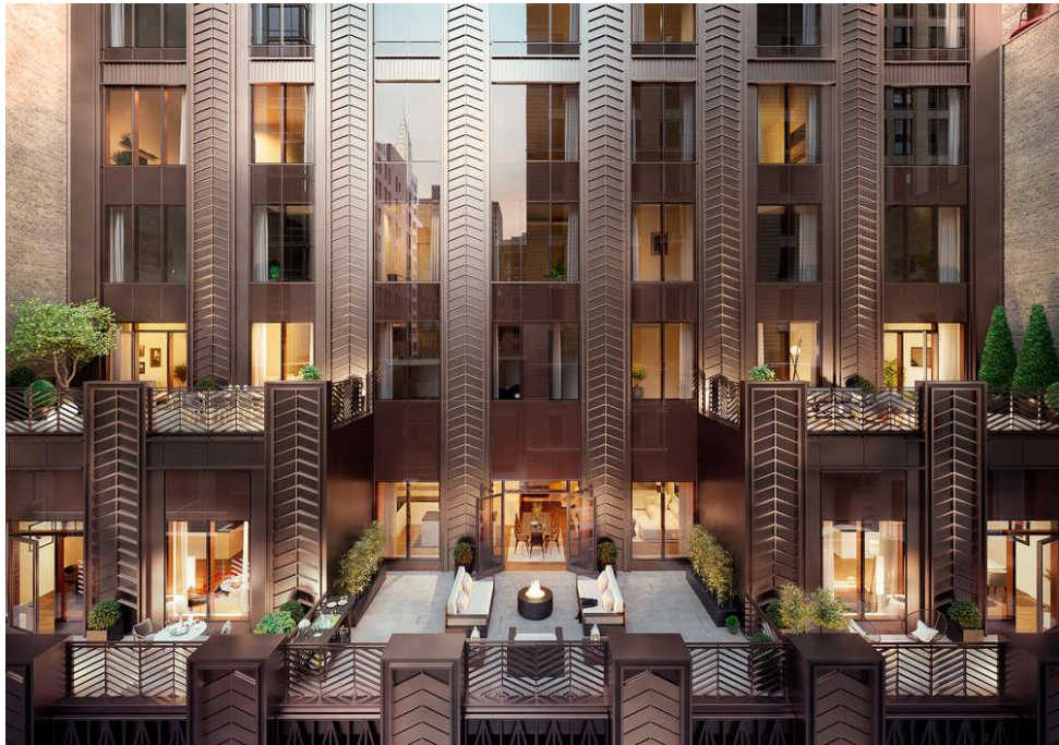
All renderings of Rose Hill

From the time Rockefeller Center opened to the public, Rockefeller Group has been very much a part of New York's history. Its first residential building, Rose Hill, seeks to honor the past while embracing the future. The 45-story building was named after the Rose Hill Farm estate that once covered the site, and the design by CetraRuddy pays homage to Art Deco buildings with geometric accents, intricate details, and expansive windows. Sales have just launched from $1.195 million on the luxury condos within.